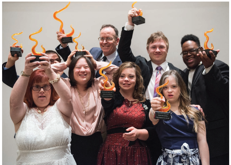
The cast of A&E's hit show Born This Way celebrate their Catalyst Award win.

Each year, The Arc puts on a national convention which plays host to world renowned advocates, self-advocates, experts in the disability community, caregivers, direct support professionals, family members of individuals with I/DD, and leaders from The Arc's chapter network. In 2016, The Arc had the honor of once again partnering with Inclusion International to host the 2016 National Convention and International Forum in Orlando, Florida. The event was a rousing success with nearly 1000 advocates from across the globe joining together to "Shape the Future".