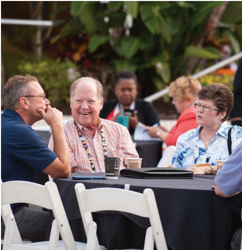
Convention attendees network and enjoy the Florida weather.